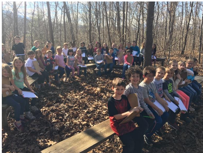
Second graders enjoying the outdoor classroom! They used their senses to come up with a great idea to write about.

The Spring Book Fair is just around the corner. The fair will run from March 11 at 8 am until March 15th at 4 pm. Book Fair catalogs will be going home soon. Until then check out our Book Fair website at: http://www.scholastic.com/bf/clydeelementaryschool3